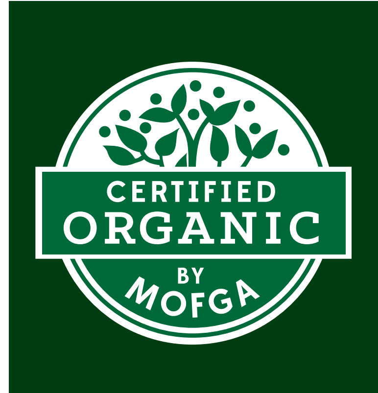
ON DARK BACKGROUNDS