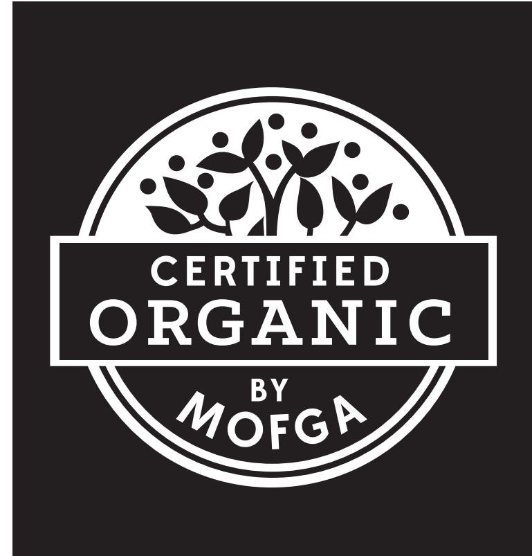
IN BLACK AND WHITE