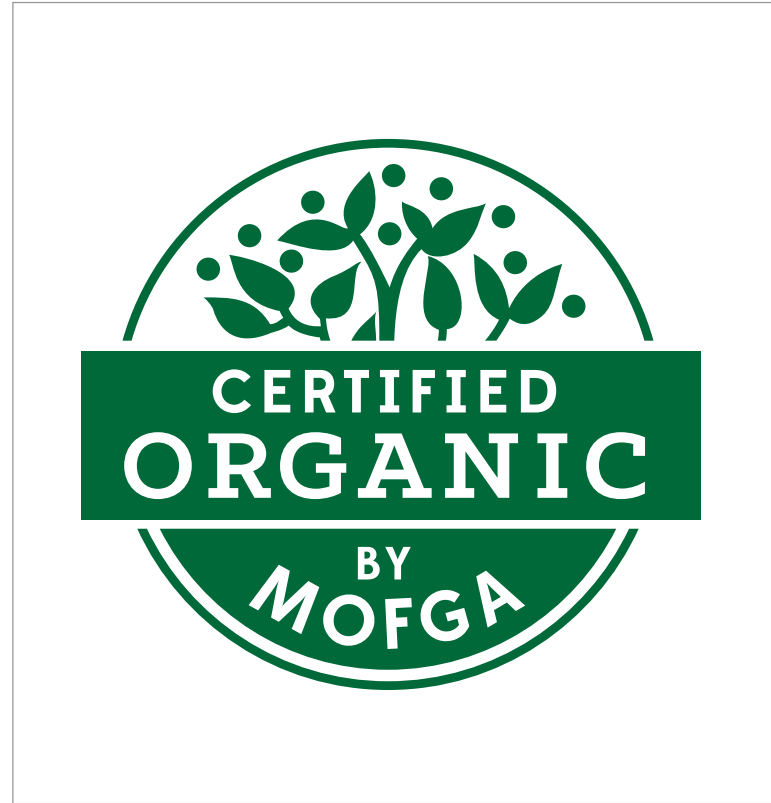
ON LIGHT BACKGROUNDS